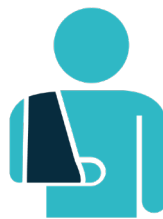
Disability Insurance Benefits