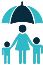
Group Life Insurance Benefits