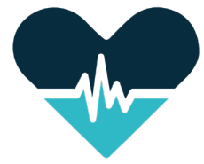
Dreaded Disease Benefits