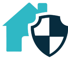
Retirement Savings Funds (provident and pension funds)